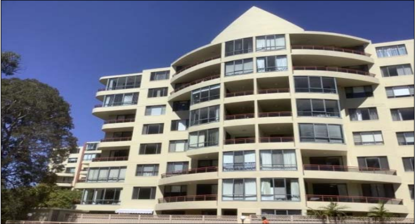
1-15 Fontenoy Road, Macquarie Park :: SP52948