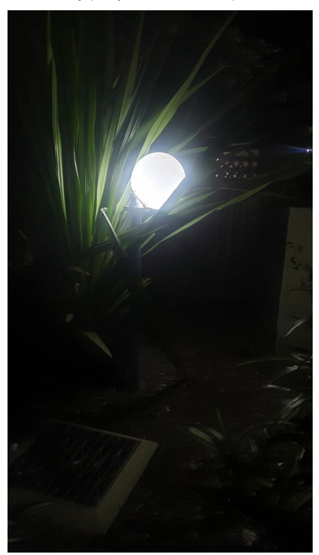
SP52948 – unsafe light post in garden near Block B on 8^{th} of September 2021